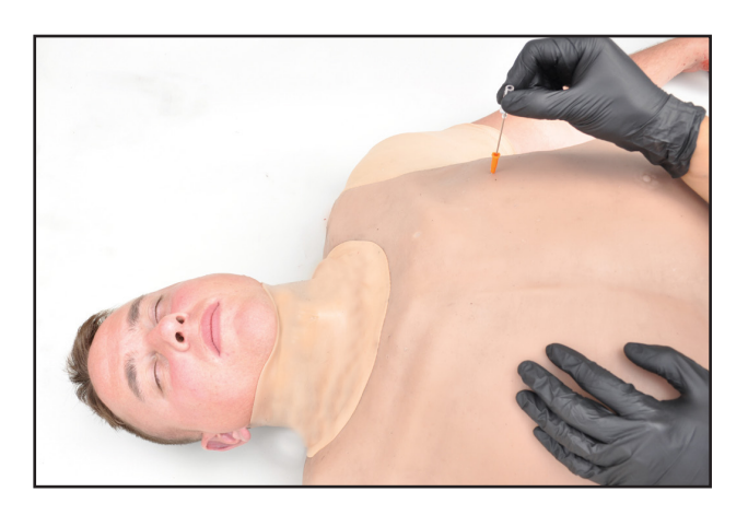
Chest Needle Thoracentesis